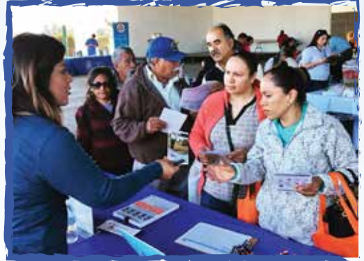
We love attending events and informing people about the benefits of vanpools. -Bakersfield, Ca