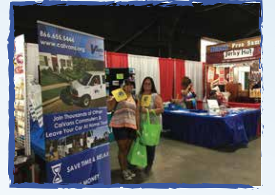
At the Tulare County Fair, giving out great information and goodies. -Tulare, Ca.