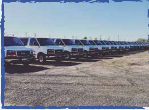
Getting our vans clean and ready -El Centro, Ca