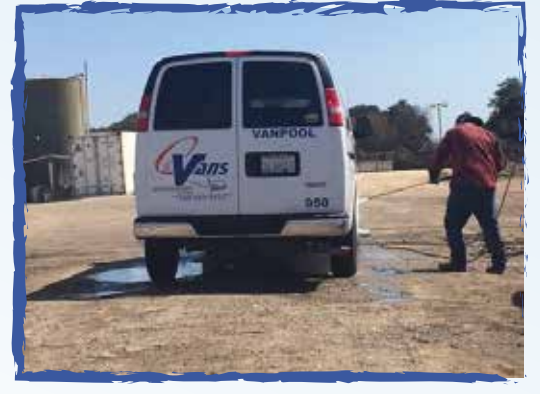
Our vanpoolers keeping their van clean. They're the best! -Salinas, Ca