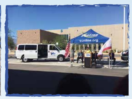
New partnership with SunLine, vanpools are now available in Riverside! -Thousand Palms, Ca